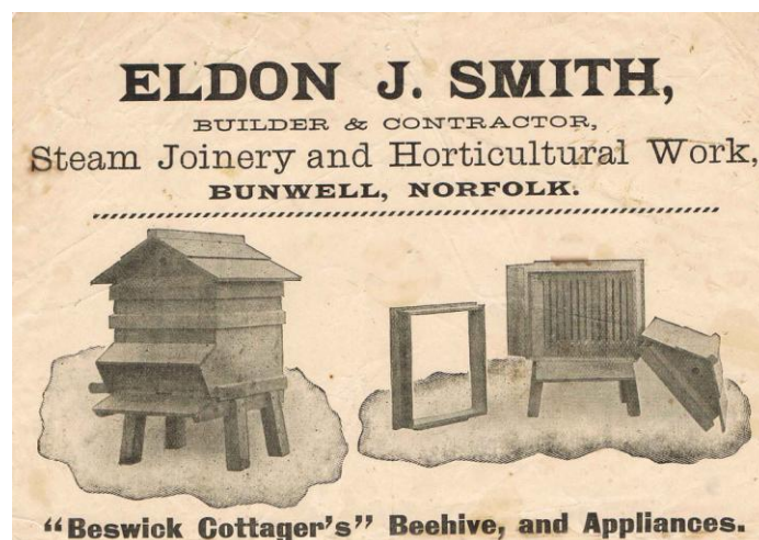
Figure 3 Beswick’s Cottager Beehive Part of a flyer advertising one of the Steam Joinery’s products

By 1928 E.J. had a Steam Joinery Works at Double Bank, Carleton Rode. 42