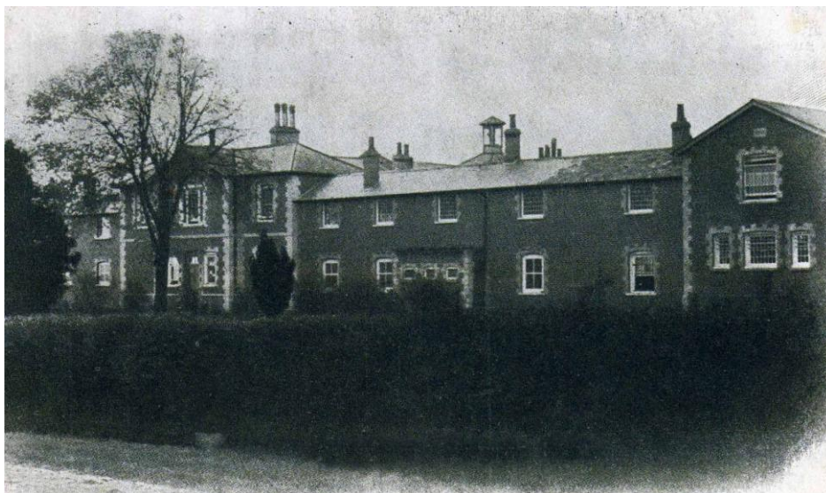
Figure 2. Eastern Counties Inebriate Reformatory Kenninghall.

E.J. was contracted to undertake various building work at local schools in the 1890s: including drainage work at Aslacton School, 11 the enlargement of Forncett School, 12 and additions to Bunwell Board School buildings in 1893. 13 When the builder constructing Great Ellingham village school went bankrupt, E.J. took over and completed the work in 1896. 14